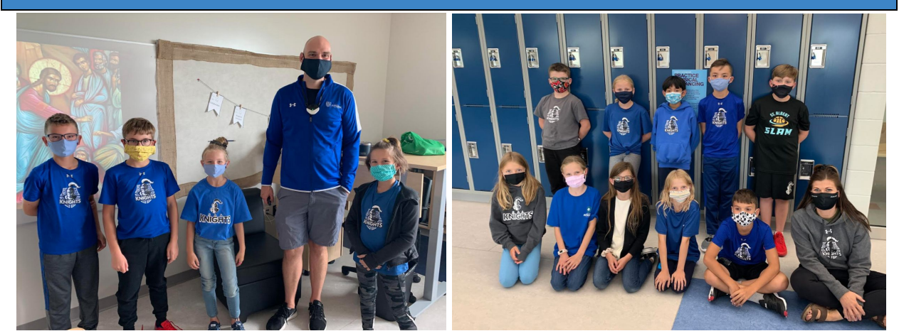
SAA Bulletin #2 - Monday, September 7, 2020