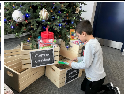
Students at SAA spread the JOY of Advent with their families at home.