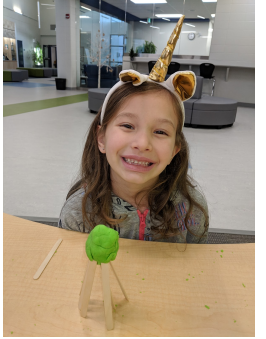
Students at SAA are COLLABORATORS and INVENTORS - Here is the 2/3 class and their Legal School buddies