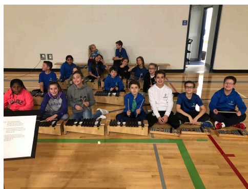
Our grade six class played while all students sang Walk With Me.